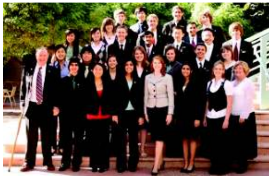
Corona del Sol High School